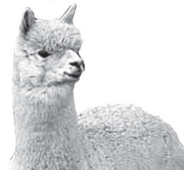
The Marquette Food Co-op's Upper Peninsula Farm Directory