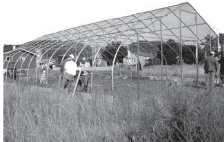
The Marquette Food Co-op's Upper Peninsula Farm Directory