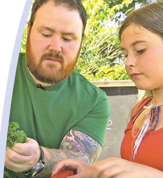
Making fresh veggie wraps at Putney Community Garden.