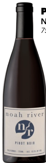
Pinot Noir Noah River 750ml