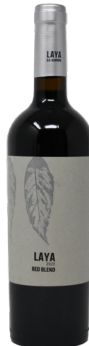
Laya Bodegas Atlaya 750ml