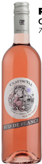
Rose Languedoc Claude Val 750ml