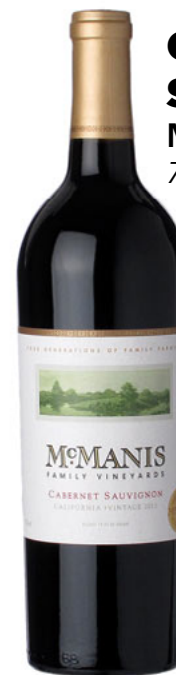
Cabernet Sauvignon McManis 750ml