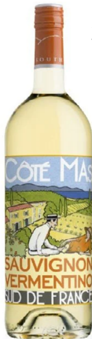
Sauvignon Vertmintino Cote Mas 750ml